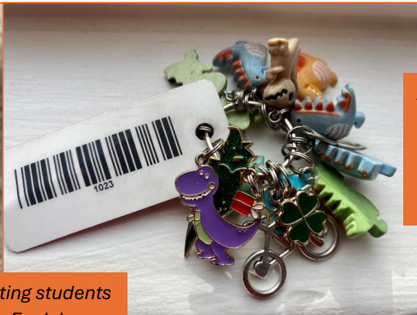
A collection of "Dino Charms" can be seen on a student's key ring at the end of the school year.